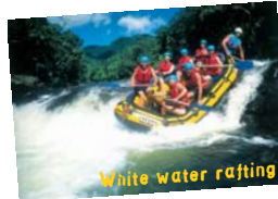
White water rafting