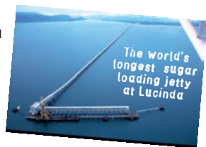
The world's longest sugar loading jetty at Lucinda