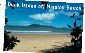
Dunk Island off Mission Beach