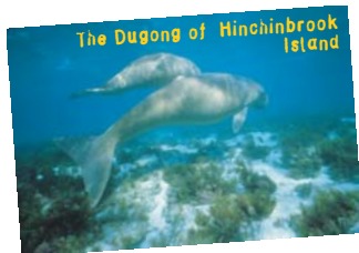
The Dugong of Hinchinbrook Island