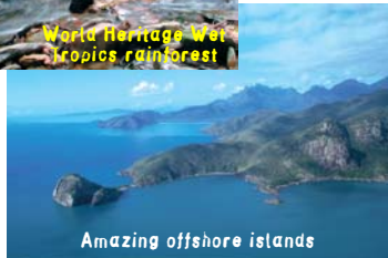
Amazing offshore islands

The Great Green Way is an area of outstanding natural beauty spanning from Townsville to Cairns, including two World Heritage listings of the Wet Tropics Rainforests , and the Great Barrier Reef .