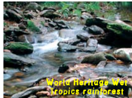
World Heritage Wet Tropics rainforest