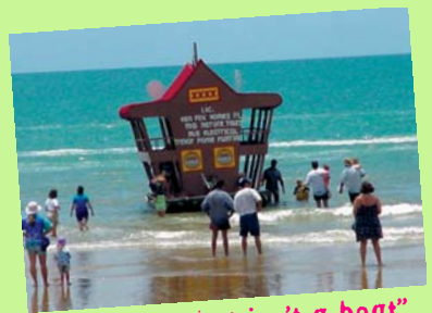
The "boat that isn't a boat" Mission Beach Aquatic Festival